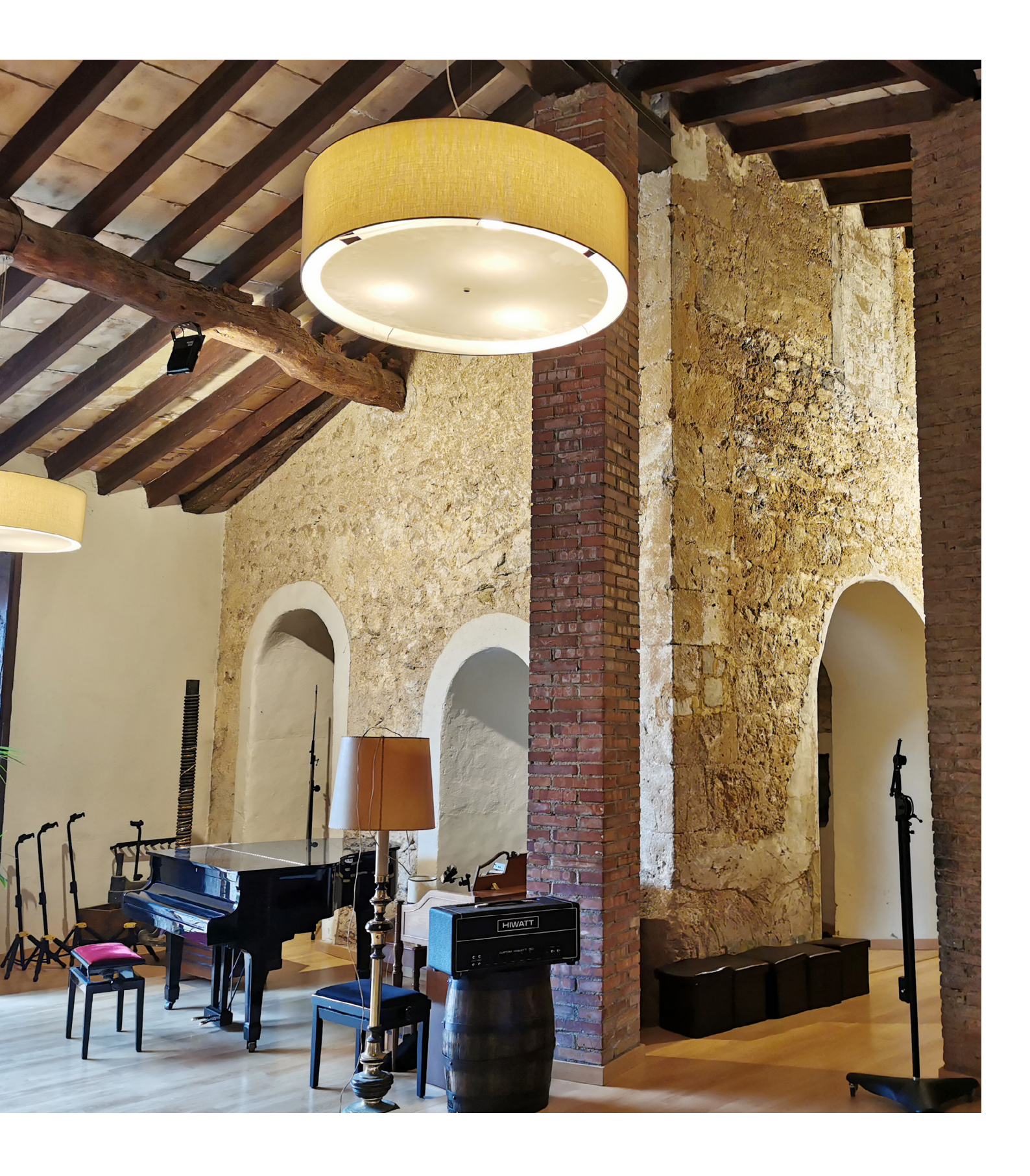
COMBINING 12TH CENTURY ACOUSTICS WITH STATE-OF-THE-ART AUDIO TECHNOLOGY IN SPAIN.