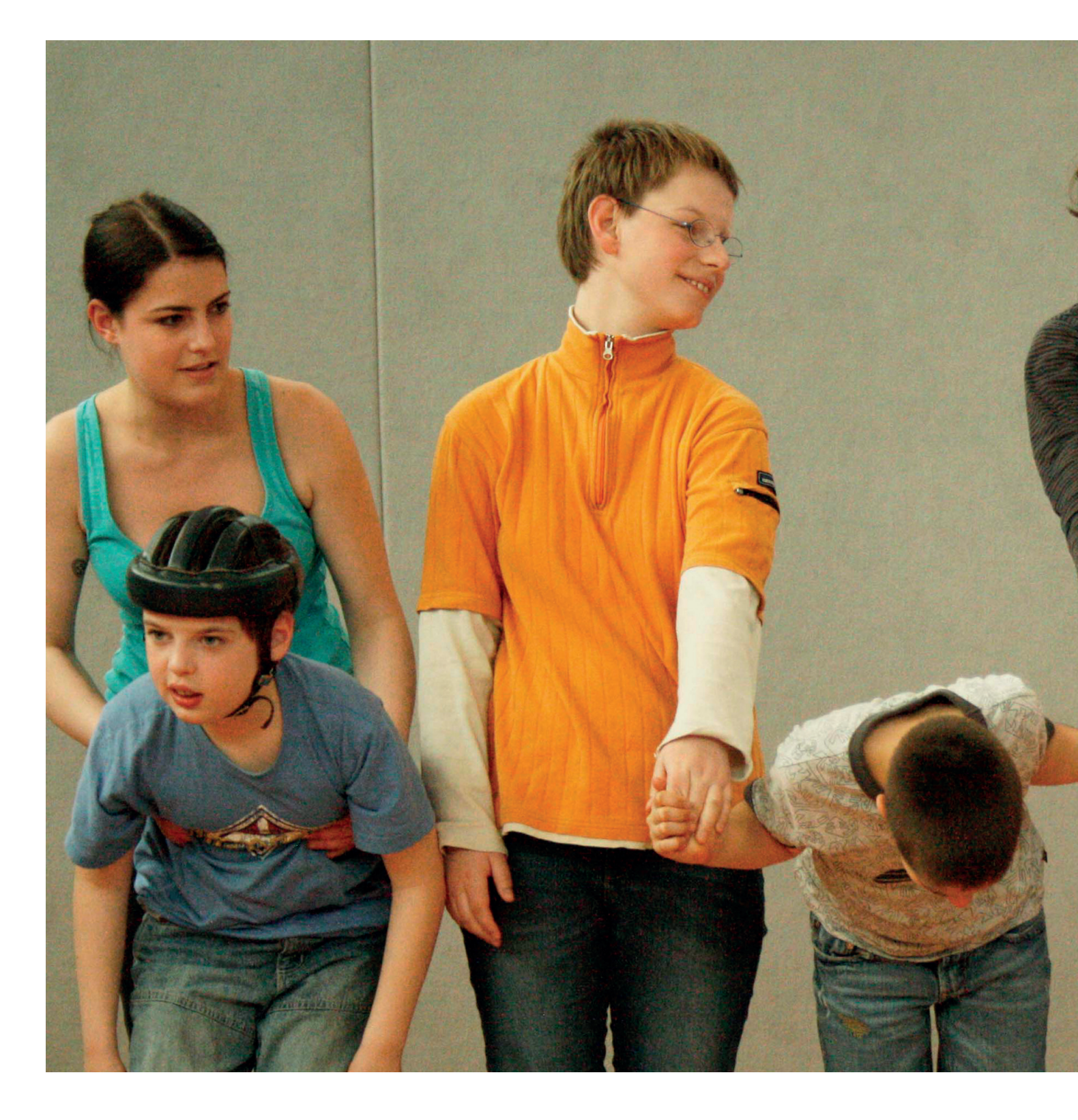
MOTIONCOMPOSER 3.0 CREATES THE MUSIC OF MOVEMENT WITH PRISTINE SOUND BY GENELEC