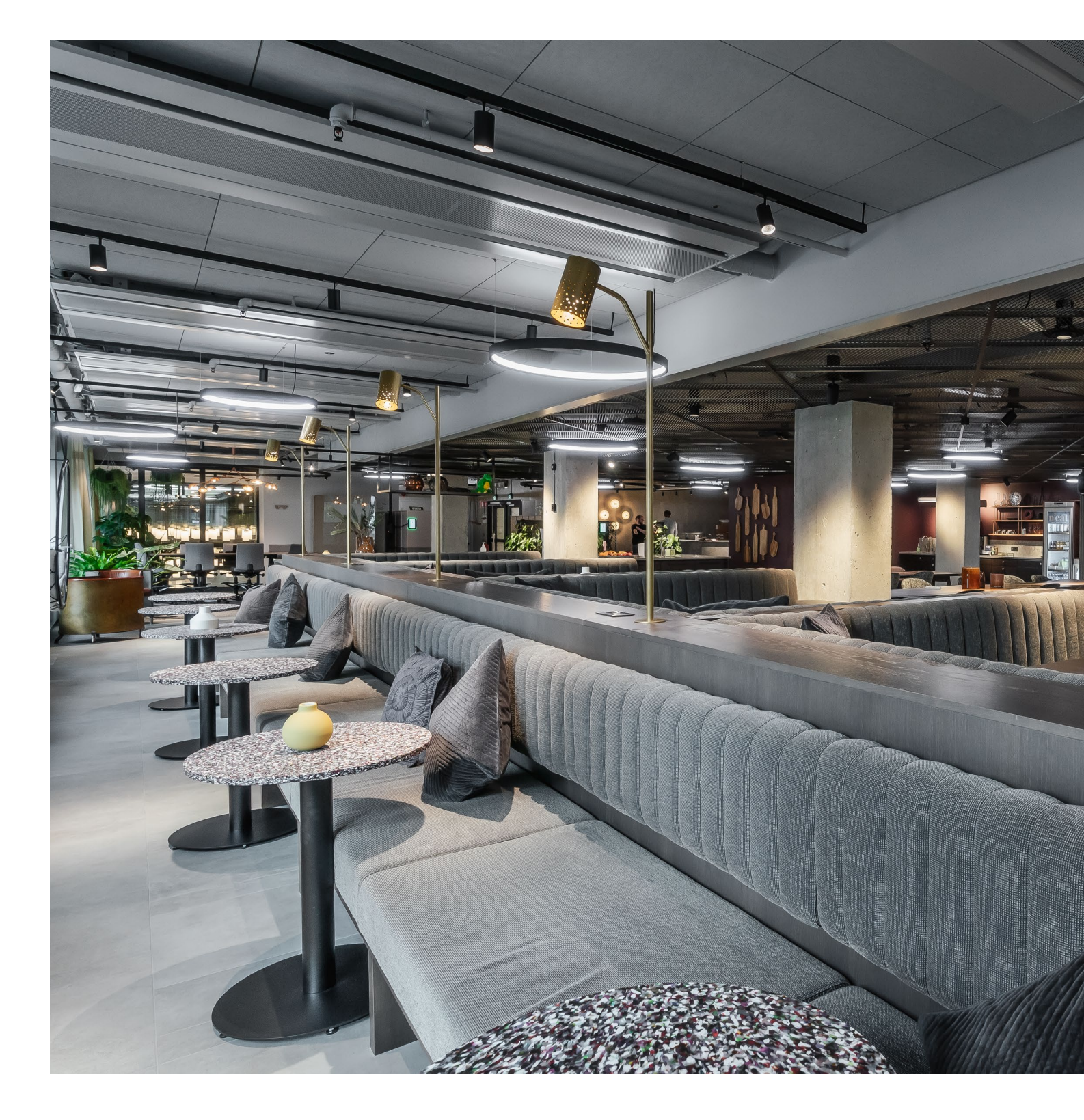
VASAKRONAN OPTS FOR ELEGANCE, WELLBEING AND SUSTAINABILITY WITH GENELEC AND EFTERKLANG